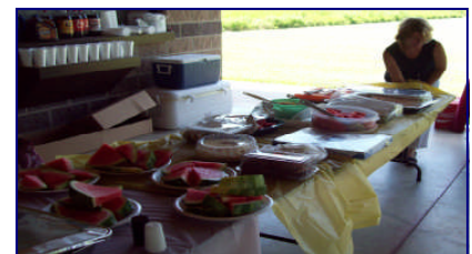
THE DESSERT TABLE !!!