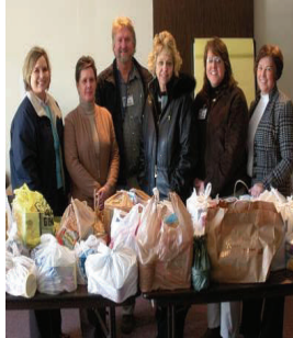
Baxter's employees & donations.