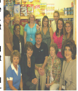
Food & Nutrition Unit

The great thing about this grant is the fact that ultimately it benefits the citizens of McDowell County that are being effected by the current economic downturn. This is just another example of how dedicated this agency is to helping those that are in need.