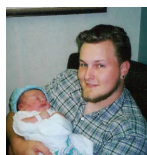
It's a "Grandson"